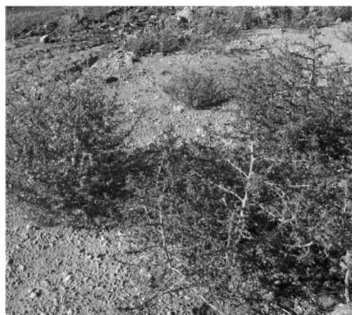
Fig. 5. Forms of Salsola australis growing sympatrically on the Landor Road: S. australis subsp. Compact (left), subsp. Glaucous (right) and small plants of subsp. Pubescent (top centre).

At Gwalia near Leonora, two forms occurred sympatrically on rocky slopes, S. australis subsp. Compact (R.J.Chinnock 10176) formed a rounded glabrous shrub to 0.8 m tall. Salsola australis subsp. Compact is a very common taxon and has been observed in various parts of Western Australia, Northern Territory and South Australia. The other form, S. australis subsp. Strobilifera (R.J.Chinnock 10177), was a low irregularly shaped glabrous shrub to 30 cm tall with well defined clusters of fruits forming 'cones' on short